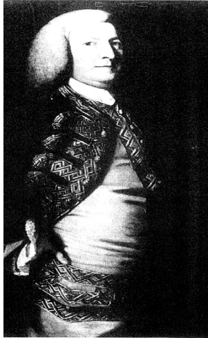
George Anson after Reynolds.

As to the text itself, presented by John Masefield as “(...) one of the most popular of the English books of voyages”, (xvii) 2 it may be viewed as a product of the late Stuart to mid-Hannoverian period, whether in the assertion of a naval supremacy heralded by the Navigation Acts, the Anglo-Dutch wars, or those of the League of Augsburg (1688-1697), the Spanish and the Austrian successions (1702-1713 and 1740-1748, respectively); 3 in the philosophical and scientific appeal of (and to) empirical observation, information and data, conveyed with objectivity and conciseness, as prescribed by the Royal Society; 4 and in the self-confident and optimistic tone usually